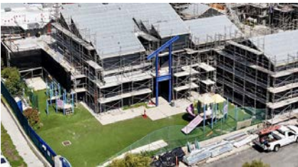
Ocean Park neighborhood school Exterior photo showing school taking shape.

Olympic High School will remain at Santa Monica College for the fall semester and will return to the Obama Center following the reopening of the Ocean Park neighborhood school.