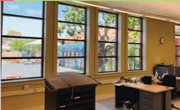
The modernization project was largely completed, including new floors, paint, windows, doors and ceilings. It has updated and enhanced the entire campus.