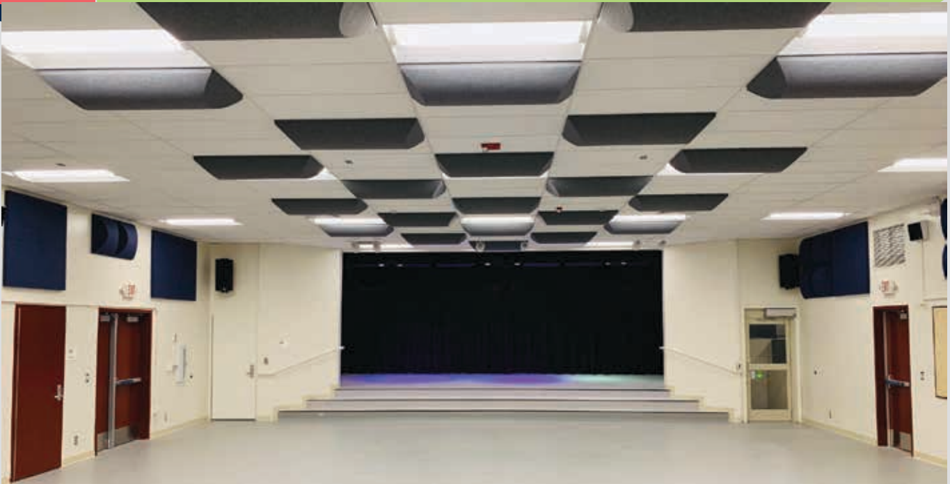
Complete modernization of library / media center, computer lab, science lab, auditorium (shown), and music lab.