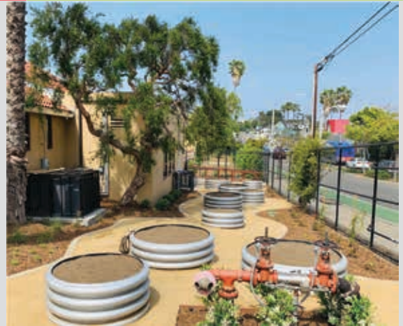
Upgraded external areas with new beds, large planters, and new concrete edging.