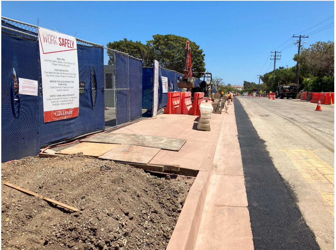
Morning View Drive Street Improvements and New West Driveway