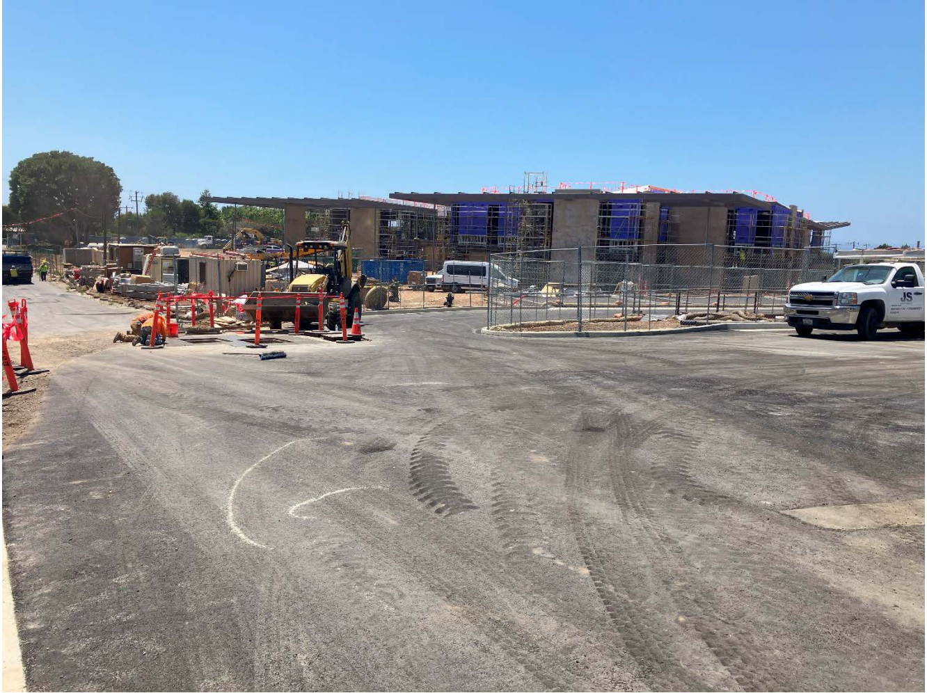
New Bus Turnaround Looking West