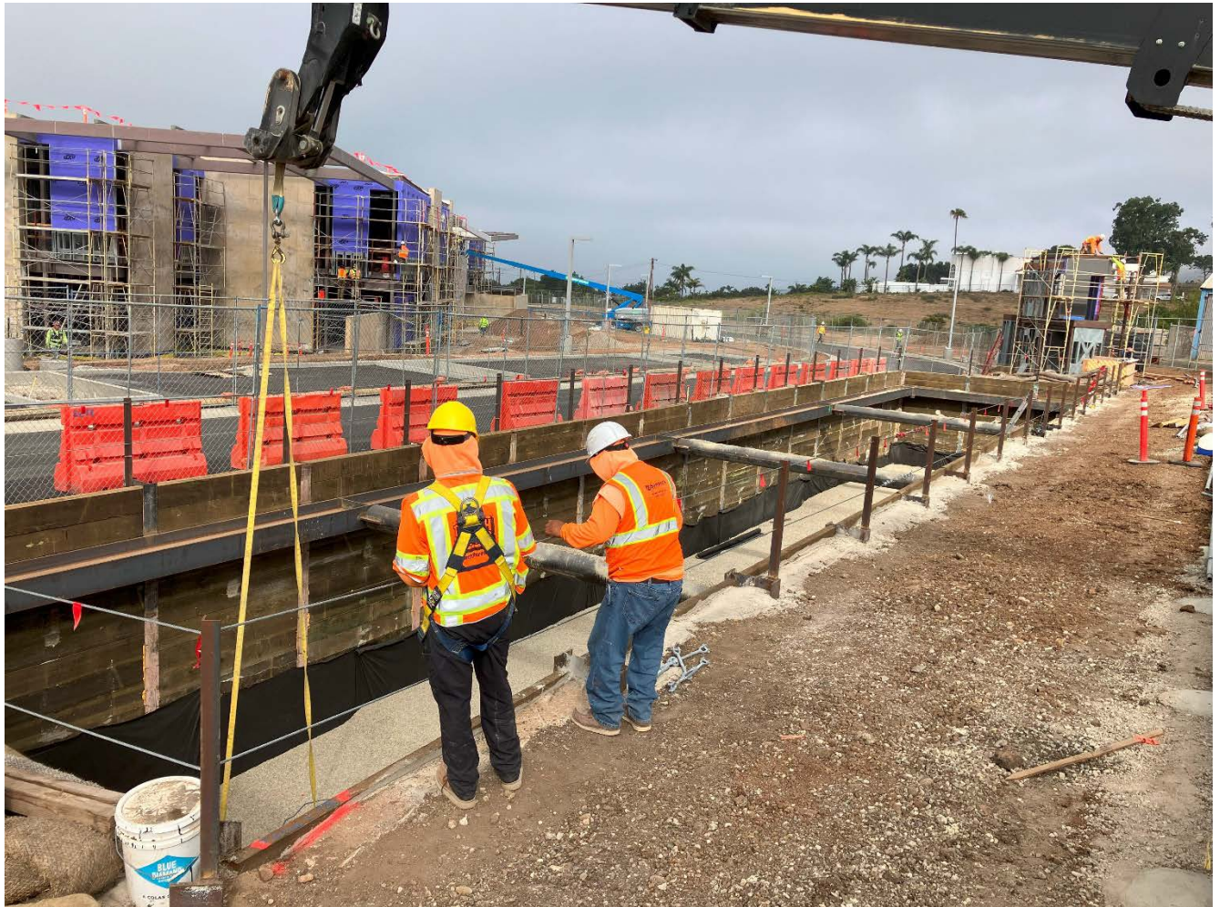
Wastewater Treatment Plant Excavation