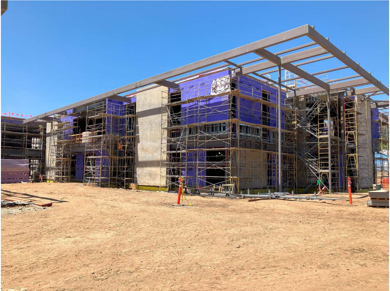
Exterior Framing & Densglass