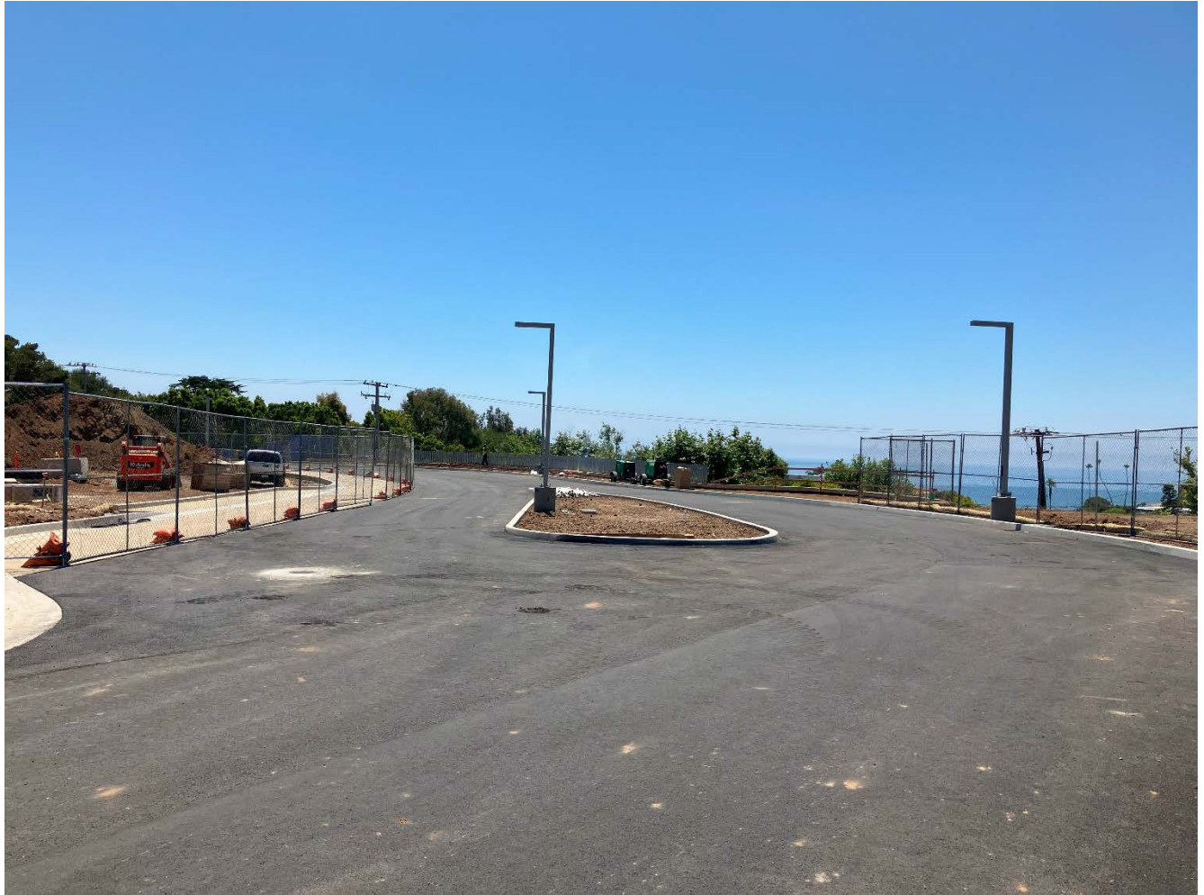
New Access Road with Light Poles Looking West