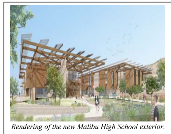
Rendering of the new Malibu High School exterior.

Join the tradition! The Santa Monica-Malibu Unified School District cordially invites Malibu students, staff, elected officials and parents to participate in a significant milestone in the construction of the new award-winning Malibu High School (MHS). The District is proud to announce a steel topping out ceremony set to occur at Malibu High School on Thursday, March 21, 2024, at 3:45 p.m. Your presence is invaluable as we commemorate this momentous occasion together.