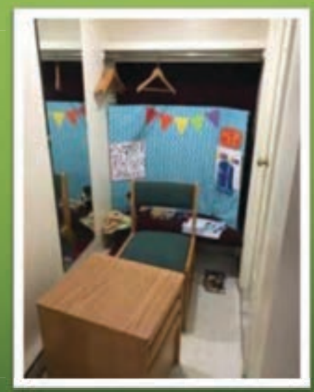
Small spaces can be used creatively to make a fun & quiet learning area. Things like drawers can be creatively turned into desks.