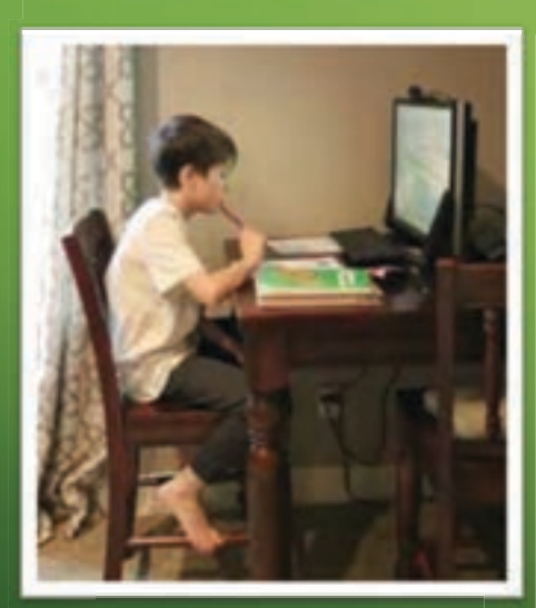
Students should be seated upright (not on a bed).