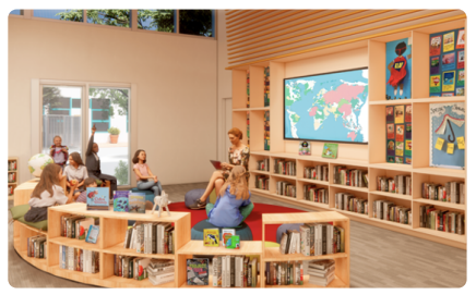
Interior rendering of new library