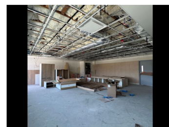
Early Learning Building Interior of classroom.