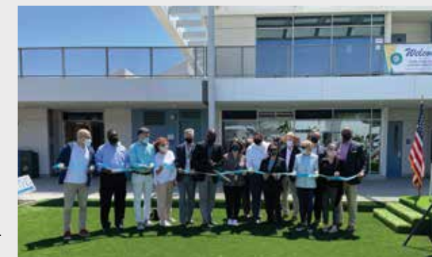
New Malibu High School, environmentally sustainable design

Student Safety and Security: Alarm and security systems with new visitor check-in has been completed at all SMMUSD schools.