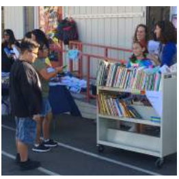
We had a blast at the Back to School Picnic. Wonderful parent volunteers put together a great event with music, face painting, grilled corn and hot dogs, desserts, and spiritwear and books for sale. Families and staff had a great time hanging out at this fun casual annual event.