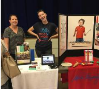
At our Info Fair on the first day of school parents learned about school and community groups.